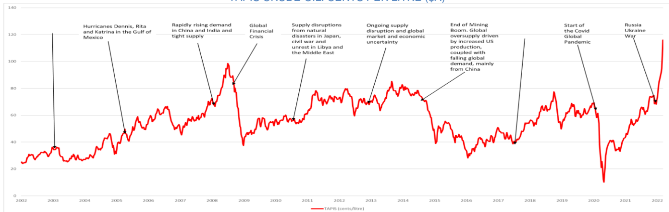
Major Events Impacting on Crude Oil Prices TAPIS CRUDE OIL: CENTS PER LITRE ($A)

For example, in recent years, two major events have dramatically impacted the price of crude oil and in turn the price of petroleum products: